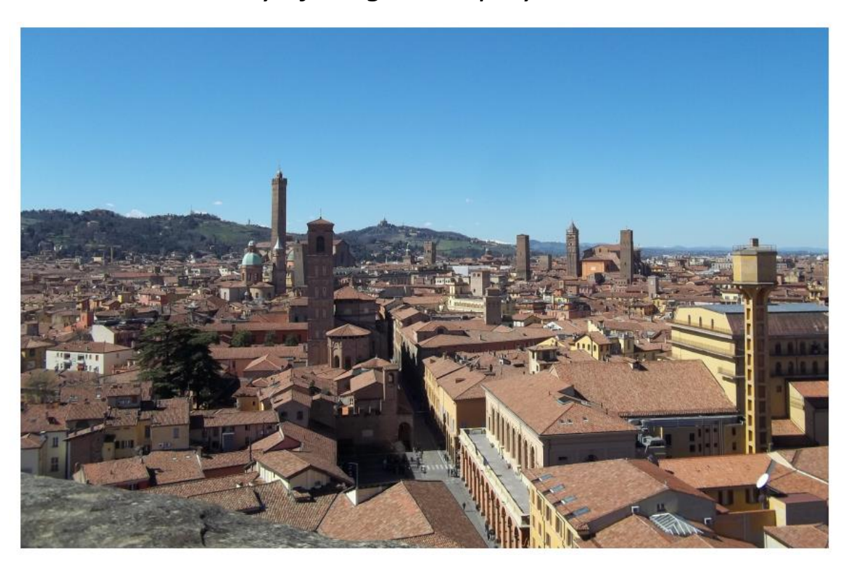
June 27<sup>th</sup> – 30<sup>th</sup> 2023 Complesso Belmeloro, University of Bologna, Italy

Sustainability of drug use: equity and innovation